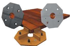
Shadowline Black Hardwood Brown Concrete Grey

Available in 3 colors to match install surfaces.